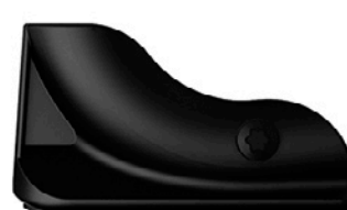
Plastic glide element as insert