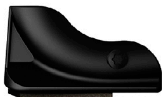
Felt glide element