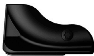
2-component glide element as insert