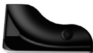
Dual-component glide element