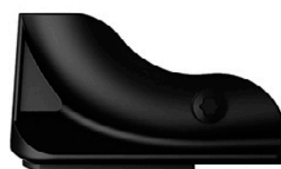
Plastic glide element