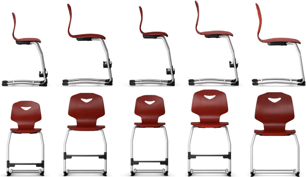
Students' chairs for 71 cm high tables