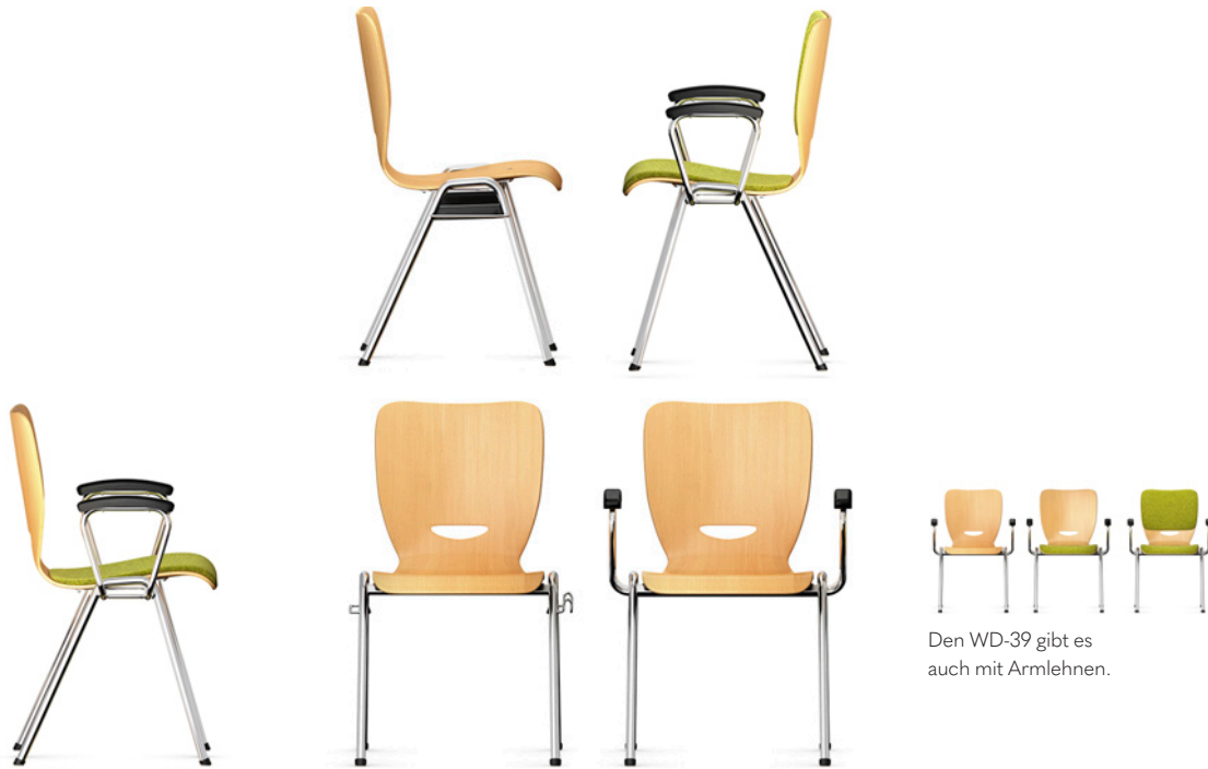
Den WD-39 gibt es auch mit Armlehnen.