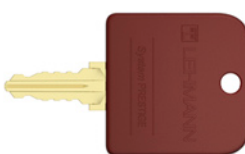
Dismounting key for locking systems 18000 and 19000 (dependent on lock number)

ORDER FORM FOR SPARE PARTS 45-076-19 V07 - 25.01.2024 - www.vs-moebel.de