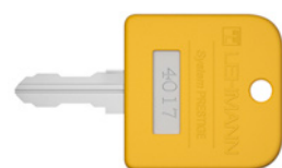
Dismounting key for locking system 4000 (dependent on lock number)