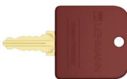
Dismounting key for locking systems 18000 and 19000 (independent on lock number)