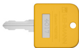
Dismounting key for locking system 4000 (independent on lock number)